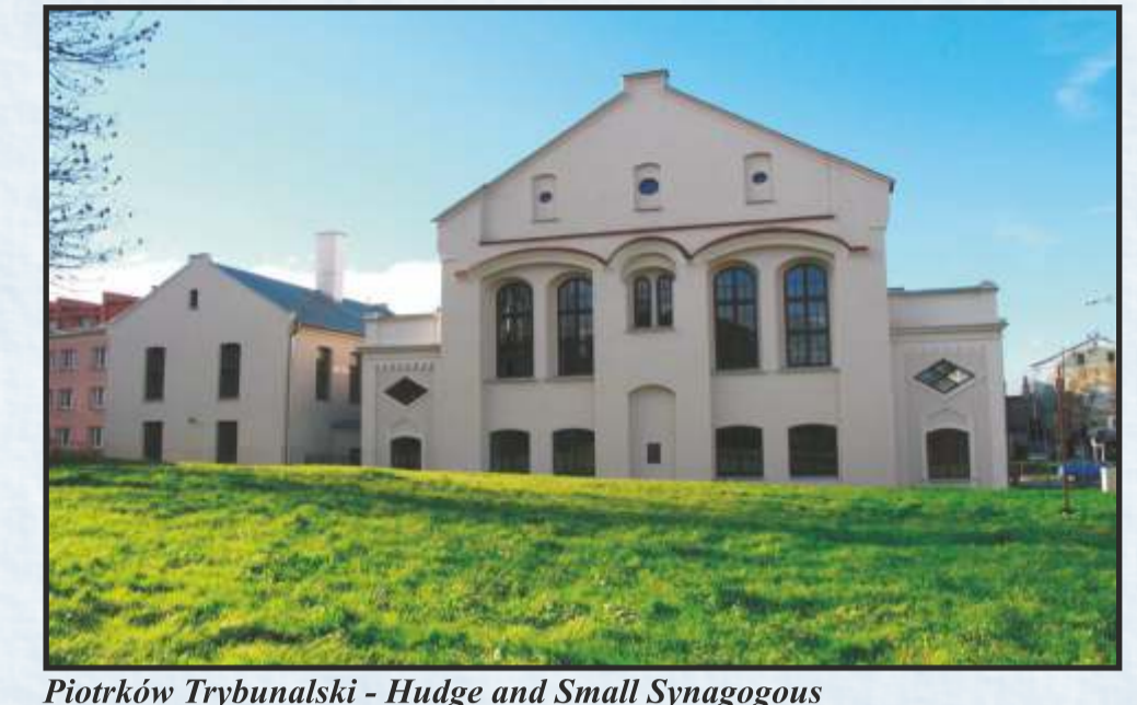
Piotrków Trybunalski - Huge and Small Synagogues