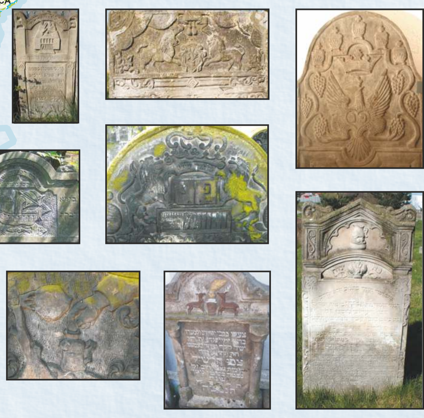
Prayers and pleadings written on paper and left an tzaddiks thombs. Thombs of tzaddiks in Radomsko and Piotrków Trybunalski at the pictures below.