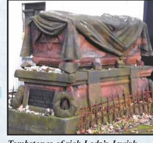
Tombstones of rich Łódź's Jewish