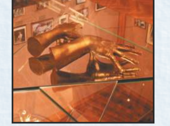
Museum pieces in City of Łódź Museum