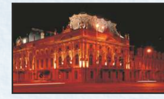
Łódź, 32 Gdańska str. - former K. Poznański Palace, Music Academy at present