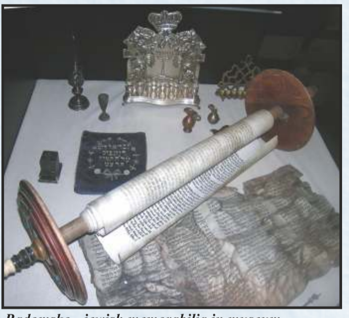
Radomsko - jewish memorabilia in museum