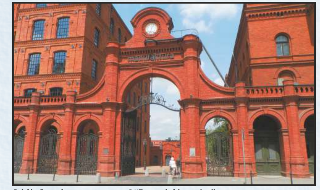
Łódź, Ogrodowa str. - gate of "Poznański empire"