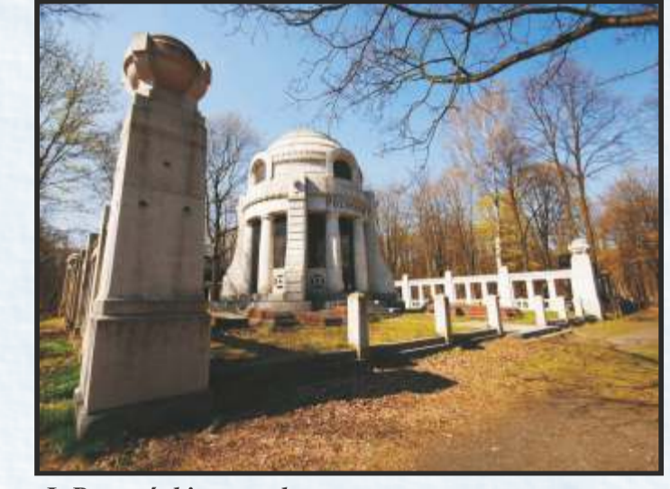
1. Poznański mausoleum Foundatore of the cemetery land