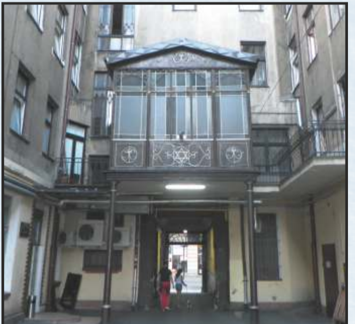
Łódź, 88 Piotrkowska str. - balcony "kuczka" / sukka