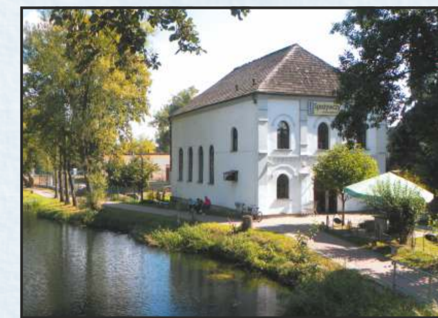
Farmer synagogue, fragments of fresco and inscriptions (Hebrew and Russian) in its interior