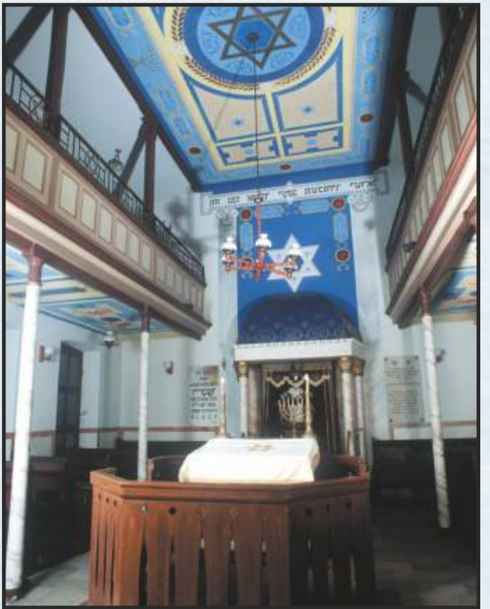
An interior of synagogue, Łódź, 28 Rewolucji str.