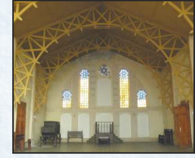
Łódź, 18 Pomorska str. - synagogue aron ha-kodesz