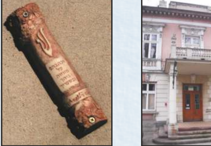
Łódź, 18 Pomorska str. - mezuzah in synagogue