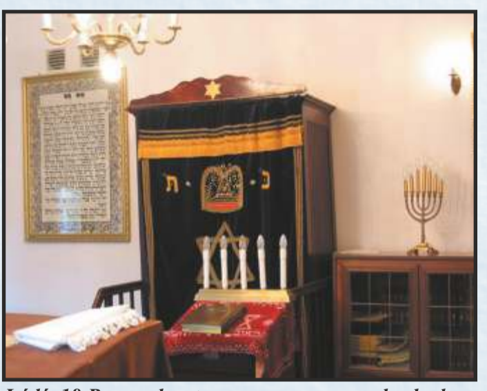
Łódź, 18 Pomorska str. - synagogue aron ha-kodesz