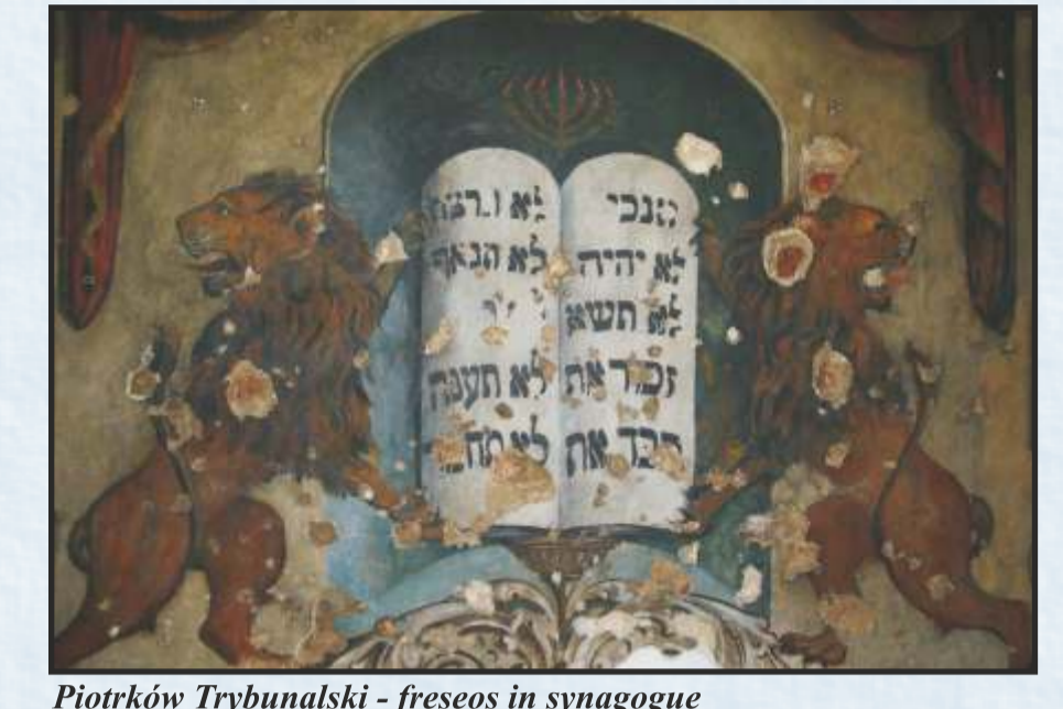
Piotrków Trybunalski - frescoes in synagogue