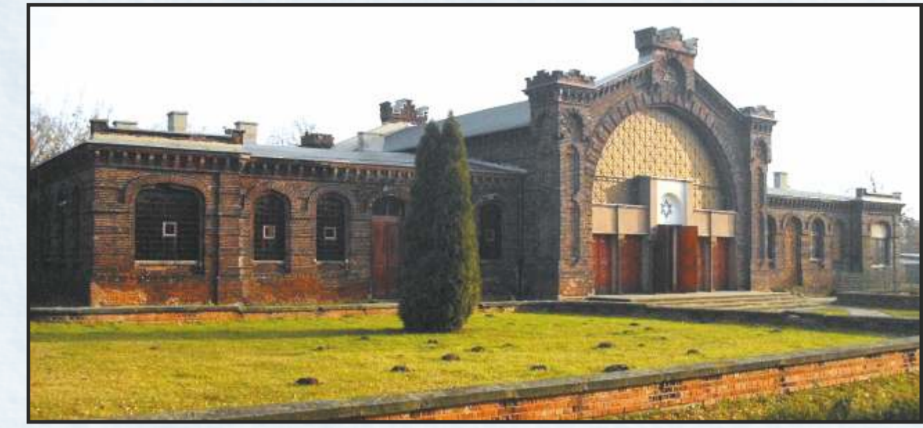
Funeral House, below its interior